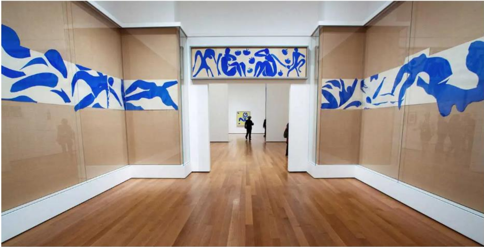
Henri Matisse, The Swimming Pool, 1952, image courtesy of the New York Times